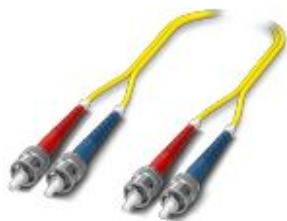
Single-mode OS2 duplex jumper, ST-ST, UPC polishing, length 2 m

Please be informed that the data shown in this PDF Document is generated from our Online Catalog. Please find the complete data in the user's documentation. Our General Terms of Use for Downloads are valid ( http://phoenixcontact.com/download )