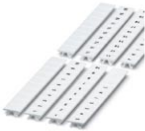
Zack marker strip, 10-section, horizontally labeled with the consecutive numbers: 11 ... 20, white, width: 7.5 mm

Please be informed that the data shown in this PDF Document is generated from our Online Catalog. Please find the complete data in the user's documentation. Our General Terms of Use for Downloads are valid ( http://phoenixcontact.com/download )