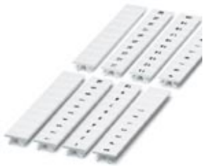
Zack marker strip, 10-section, horizontally labeled with the consecutive numbers: 31 ... 40, white, width: 6.5 mm

Please be informed that the data shown in this PDF Document is generated from our Online Catalog. Please find the complete data in the user's documentation. Our General Terms of Use for Downloads are valid ( http://phoenixcontact.com/download )