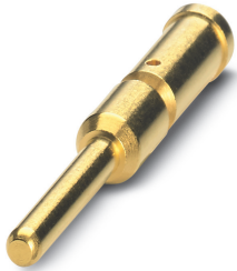
Crimp contact, turned, contact diameter: 2 mm, crimp range: 2.5 mm 2 ... 4 mm 2

Please be informed that the data shown in this PDF Document is generated from our Online Catalog. Please find the complete data in the user's documentation. Our General Terms of Use for Downloads are valid ( http://phoenixcontact.com/download )