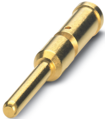
Crimp contact, turned, contact diameter: 2 mm, crimp range: 1.5 mm 2 ... 2.5 mm 2

Please be informed that the data shown in this PDF Document is generated from our Online Catalog. Please find the complete data in the user's documentation. Our General Terms of Use for Downloads are valid ( http://phoenixcontact.com/download )