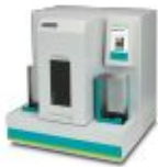
Laser marker incl. extraction unit, includes operating instructions, declaration of conformity, LS adapter plate, type E and F power cables, LAN cable, D-SUB cable 25-pos., suction tube, crevice nozzle set and filter equipment

Laser marker - TOPMARK NEO SET - 1012018