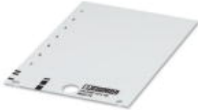
The figure shows a version of the product

Snap-in markers, Card, yellow, unlabeled, can be labeled with: BLUEMARK ID COLOR, BLUEMARK ID, THERMOMARK PRIME, THERMOMARK CARD 2.0, THERMOMARK CARD, mounting type: snapped into marker carrier, lettering field size: 27 x 8 mm, Number of individual labels: 51