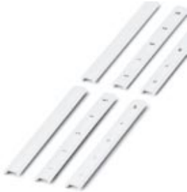
Zack marker strip, 10-section, horizontally labeled with the consecutive numbers: 1 ... 10, white

Please be informed that the data shown in this PDF Document is generated from our Online Catalog. Please find the complete data in the user's documentation. Our General Terms of Use for Downloads are valid ( http://phoenixcontact.com/download )