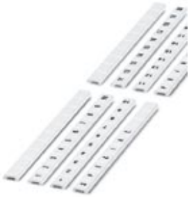
Zack marker strip, 10-section, horizontally labeled with the consecutive numbers: 21 ... 30, white

Please be informed that the data shown in this PDF Document is generated from our Online Catalog. Please find the complete data in the user's documentation. Our General Terms of Use for Downloads are valid ( http://phoenixcontact.com/download )