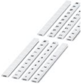
Zack marker strip, 10-section, horizontally labeled with the consecutive numbers: 11 ... 20, white

Please be informed that the data shown in this PDF Document is generated from our Online Catalog. Please find the complete data in the user's documentation. Our General Terms of Use for Downloads are valid ( http://phoenixcontact.com/download )