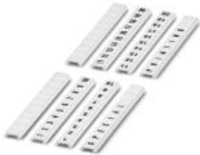
Zack marker strip flat, 10-section, vertically labeled with the consecutive numbers: 71 ... 80, white

Please be informed that the data shown in this PDF Document is generated from our Online Catalog. Please find the complete data in the user's documentation. Our General Terms of Use for Downloads are valid ( http://phoenixcontact.com/download )