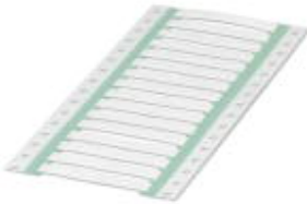
The illustration shows WMS 6,4 (30X10)R

Shrink sleeve, Roll, white, unlabeled, can be labeled with: THERMOMARK W, THERMOMARK ROLL, THERMOMARK X1.2, THERMOMARK ROLL X1, perforated, Lettering field: 30 x 5 mm