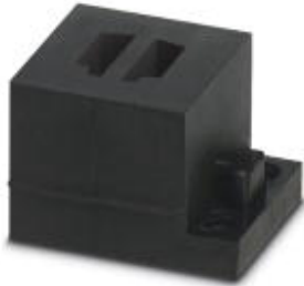
Small, slotted cable sleeves suitable for two AS-i cables (L-R), material: NBR, version: left, right

Please be informed that the data shown in this PDF Document is generated from our Online Catalog. Please find the complete data in the user's documentation. Our General Terms of Use for Downloads are valid ( http://phoenixcontact.com/download )