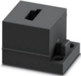
Small, slotted cable sleeves suitable for one AS-i cable (R), material: NBR, version: right

Please be informed that the data shown in this PDF Document is generated from our Online Catalog. Please find the complete data in the user's documentation. Our General Terms of Use for Downloads are valid ( http://phoenixcontact.com/download )