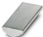
Insertion profile, color: silver