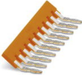
Insertion bridge, 10-pos., fully insulated, color of the insulation material: orange

Please be informed that the data shown in this PDF Document is generated from our Online Catalog. Please find the complete data in the user's documentation. Our General Terms of Use for Downloads are valid ( http://phoenixcontact.com/download )