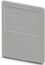
End cover, Length: 28 mm, Width: 1.5 mm, Height: 33.4 mm, Color: gray

Please be informed that the data shown in this PDF Document is generated from our Online Catalog. Please find the complete data in the user's documentation. Our General Terms of Use for Downloads are valid ( http://phoenixcontact.com/download )