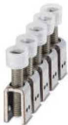
Fixed bridge, number of positions: 5, color: silver

Please be informed that the data shown in this PDF Document is generated from our Online Catalog. Please find the complete data in the user's documentation. Our General Terms of Use for Downloads are valid ( http://phoenixcontact.com/download )