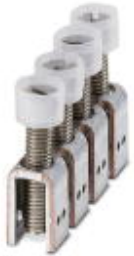
Fixed bridge, pitch: 6 mm, number of positions: 4, color: silver

Please be informed that the data shown in this PDF Document is generated from our Online Catalog. Please find the complete data in the user's documentation. Our General Terms of Use for Downloads are valid ( http://phoenixcontact.com/download )