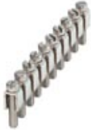
Fixed bridge, Number of positions: 10, Color: silver

Please be informed that the data shown in this PDF Document is generated from our Online Catalog. Please find the complete data in the user's documentation. Our General Terms of Use for Downloads are valid ( http://phoenixcontact.com/download )