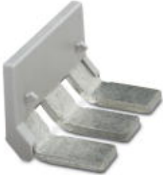
Insertion bridge, Number of positions: 3, Color: gray

Please be informed that the data shown in this PDF Document is generated from our Online Catalog. Please find the complete data in the user's documentation. Our General Terms of Use for Downloads are valid ( http://phoenixcontact.com/download )