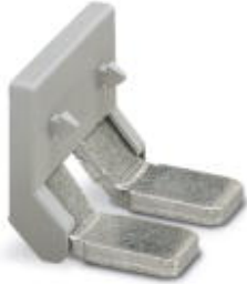
Insertion bridge, Number of positions: 2, Color: gray

Please be informed that the data shown in this PDF Document is generated from our Online Catalog. Please find the complete data in the user's documentation. Our General Terms of Use for Downloads are valid ( http://phoenixcontact.com/download )