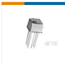
MGSC-26W=MGS .100 GRID RELAY MGSC-26W