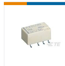
IMB06CGR 140mW 12V DIELEC.2500 1462041-3