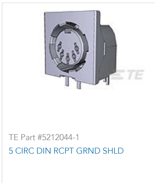
TE Part #5212044-1 5 CIRC DIN RCPT GRND SHLD