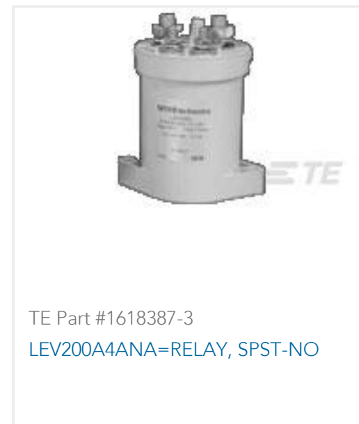
TE Part #1618387-3 LEV200A4ANA=RELAY, SPST-NO