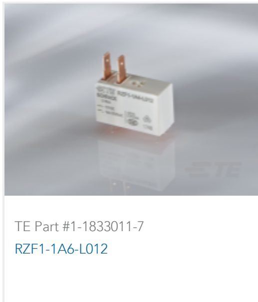
TE Part #1-1833011-7 RZF1-1A6-L012