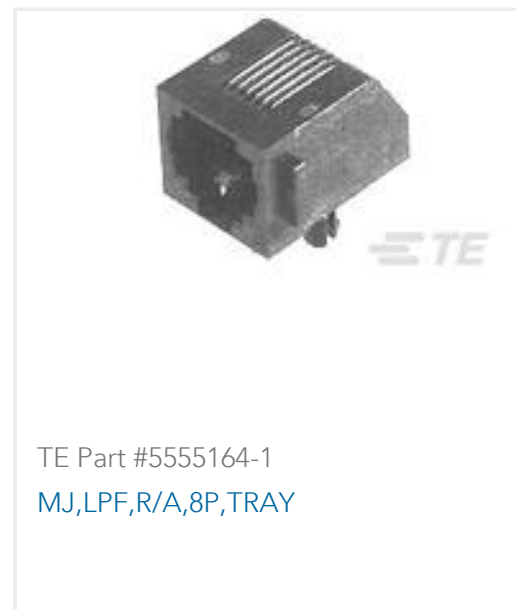
TE Part #5555164-1 MJ,LPF,R/A,8P,TRAY