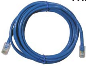
Category 5e patch cord.