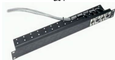
UNI-1-C Click to enlarge