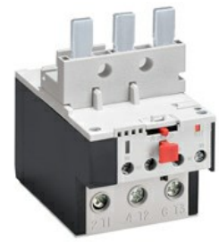
RF82 Motor protection relay