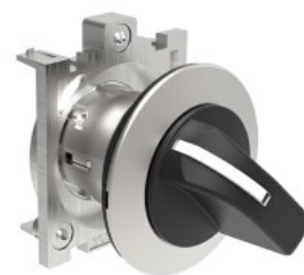
Selector switch actuators lever - 3 position LPFS13