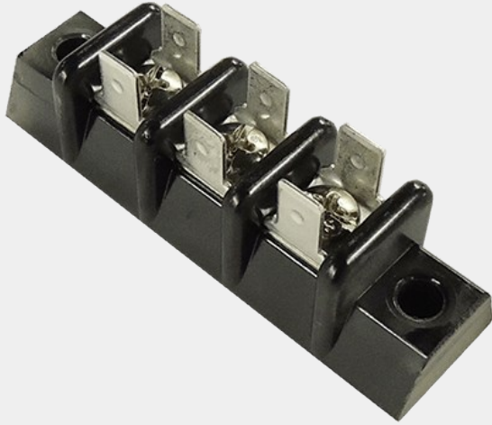
812 GP 03 KT75