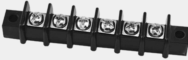
699 GP 06