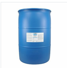
985M Soldering Flux