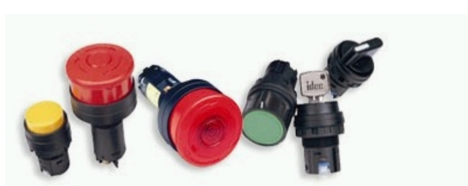
HW1F -31F20QD -A-12V

[IEC style industrial switches, pilot devices and EStops]