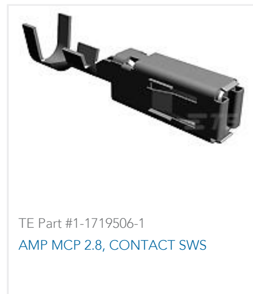
TE Part #1-1719506-1 AMP MCP 2.8, CONTACT SWS