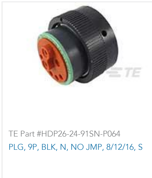
TE Part #HDP26-24-91SN-P064 PLG, 9P, BLK, N, NO JMP, 8/12/16, S