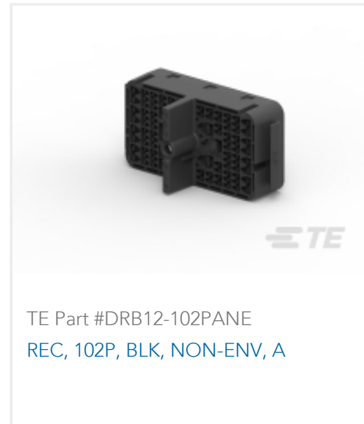
TE Part #DRB12-102PANE REC, 102P, BLK, NON-ENV, A