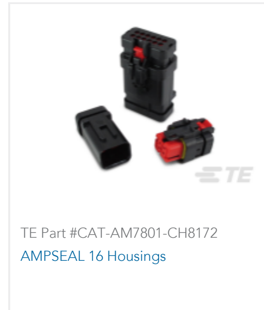
TE Part #CAT-AM7801-CH8172 AMPSEAL 16 Housings