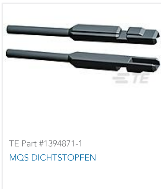
TE Part #1394871-1 MQS DICHSTOPFEN