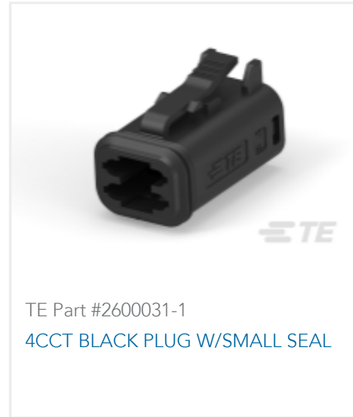
TE Part #2600031-1 4CCT BLACK PLUG W/SMALL SEAL