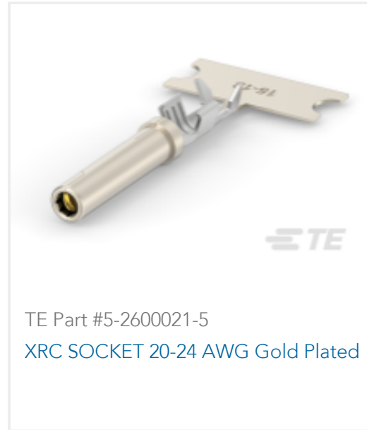
TE Part #5-2600021-5 XRC SOCKET 20-24 AWG Gold Plated