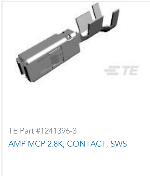
TE Part #1241396-3 AMP MCP 2.8K, CONTACT, SWS