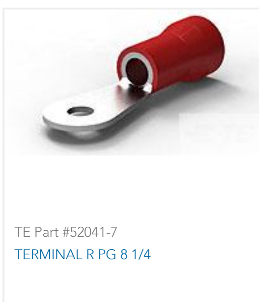
TE Part #52041-7 TERMINAL R PG 8 1/4