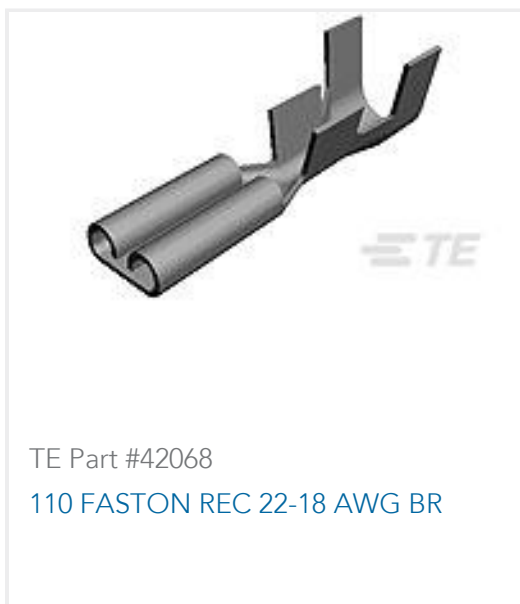
TE Part #42068 110 FASTON REC 22-18 AWG BR