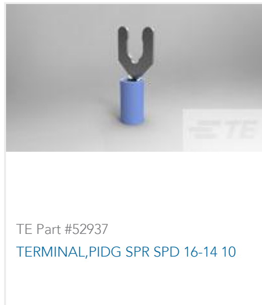
TE Part #52937 TERMINAL,PIDG SPR SPD 16-14 10