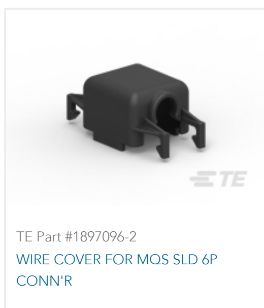
TE Part #1897096-2 WIRE COVER FOR MQS SLD 6P CONN'R