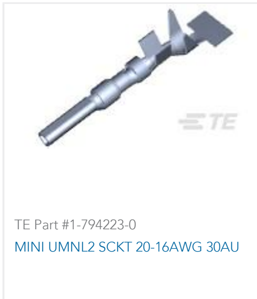
TE Part #1-794223-0 MINI UMNL2 SCKT 20-16AWG 30AU