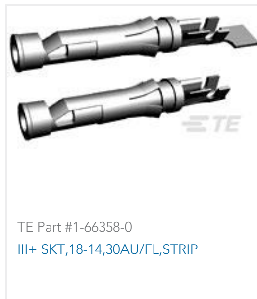
TE Part #1-66358-0 III+ SKT,18-14,30AU/FL,STRIP