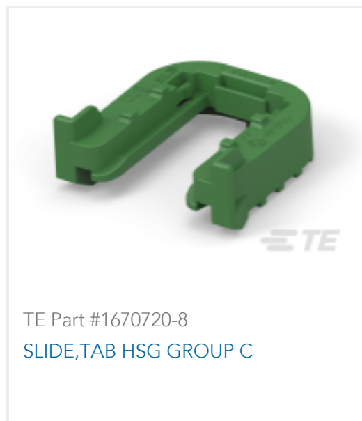
TE Part #1670720-8 SLIDE,TAB HSG GROUP C