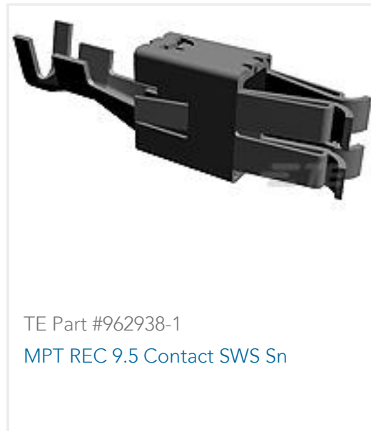
TE Part #962938-1 MPT REC 9.5 Contact SWS Sn