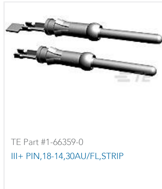
TE Part #1-66359-0 III+ PIN,18-14,30AU/FL,STRIP