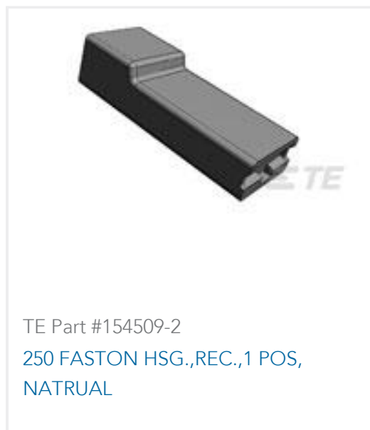
TE Part #154509-2 250 FASTON HSG.,REC.,1 POS, NATRUAL