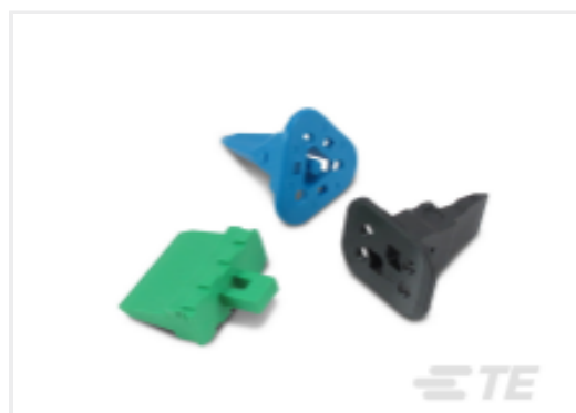
TE Part #CAT-D487-W416 WedgeLocks: DEUTSCH DT