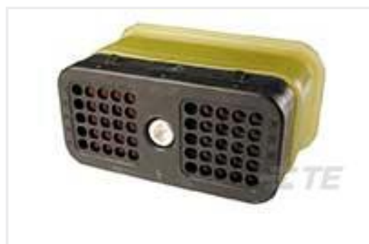
TE Part #DRC26-50S05 PLG, 50P, BLK, N, 05