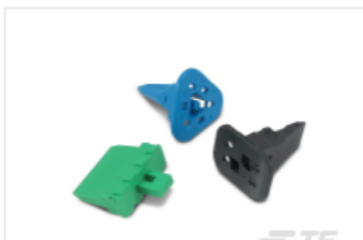
TE Part #CAT-D487-W416 Wedge locks: DEUTSCH DT