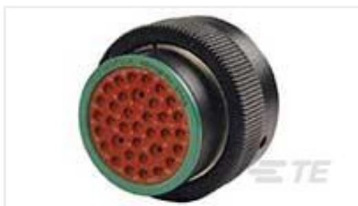
TE Part #HDP26-24-35SN PLG, 35P, BLK, N, 16/20, S