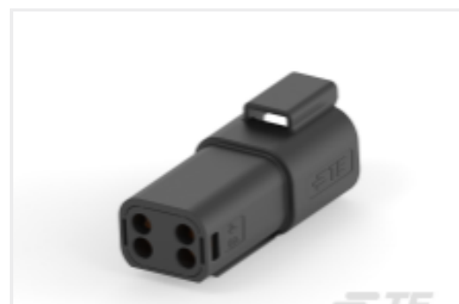
TE Part #2600030-1 4CCT BLACK RECEP W/SMALL SEAL