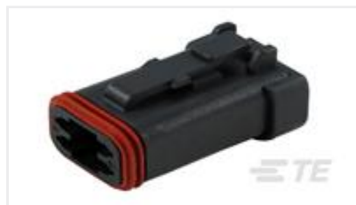
TE Part #DT06-4S-E005 PLG, 4P, BLK, N, CAP