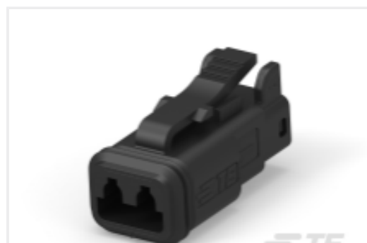
TE Part #2600023-1 2CCT BLACK PLUG W/SMALL SEAL