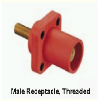
400 Amp Stud Type Panel Mount Female Receptacle, Black