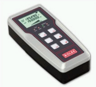
click to enlarge (Application Example)