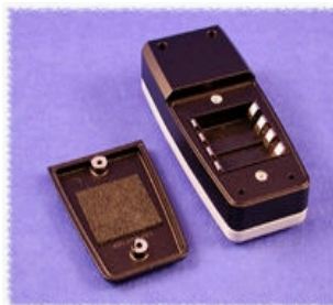
click to enlarge Open View (Bottom)