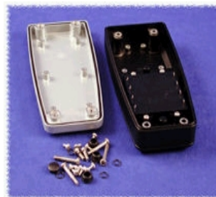
click to enlarge Open View (Top)