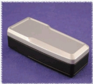
click to enlarge (Assembled View)

Path: Home > Enclosure Index > MOREnclosures > ROLEC - Sealed - Diecast Aluminum HandCase