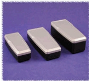
click to enlarge (Group View)