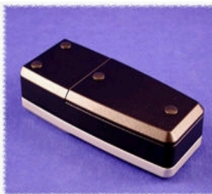
click to enlarge Assembled View (Bottom)