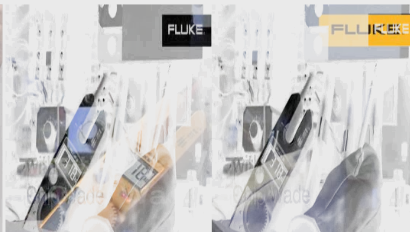
Fluke Electrical Testers: Test it Before You Touch It »