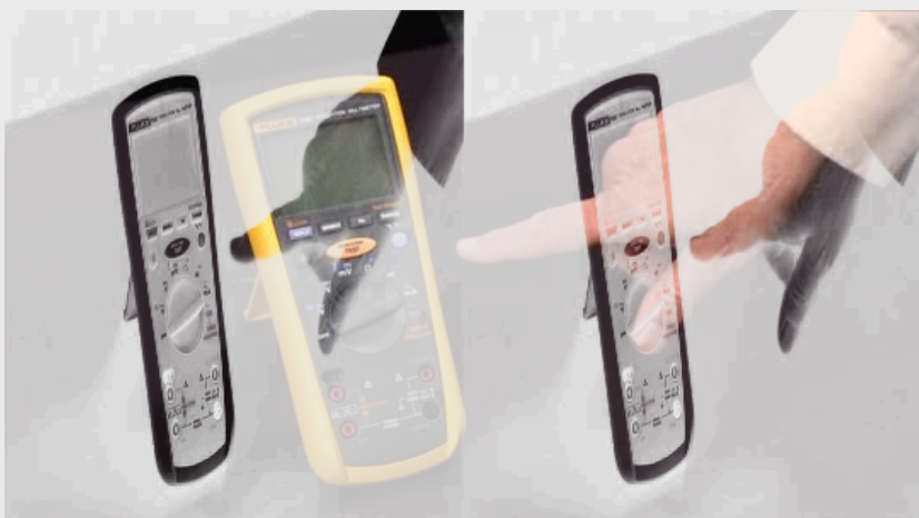
How to Measure Insulation Resistance »