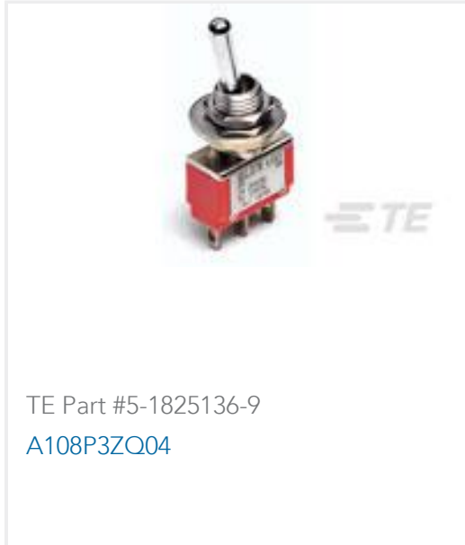
TE Part #5-1825136-9 A108P3ZQ04