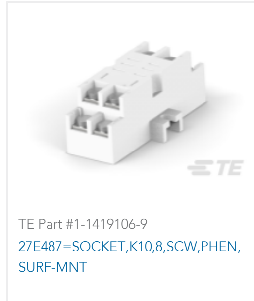
TE Part #1-1419106-9 27E487=SOCKET,K10,8,SCW,PHEN, SURF-MNT