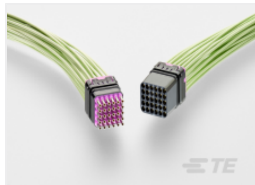
TE Part #ZPF00000000203402 DMC-MR 30-23 SC