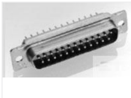
TE Part #205164-1 AMPLIMITE,ASY,PLUG,STD,109,2