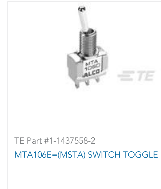
TE Part #1-1437558-2 MTA106E=(MSTA) SWITCH TOGGLE S