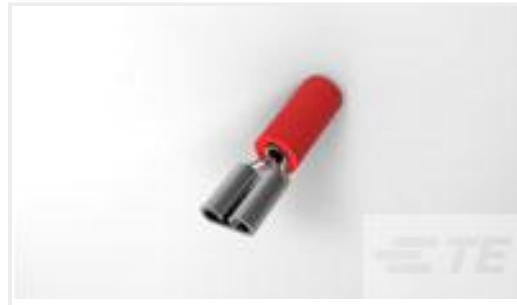
TE Part #640917-2 RECEPT,PIDG FASTON 22-18 187