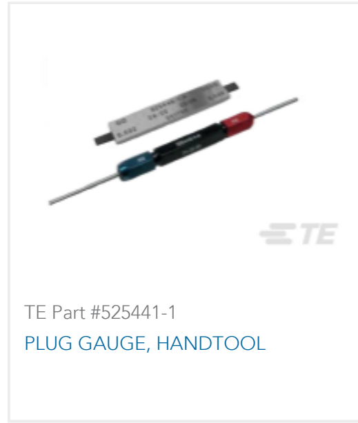
TE Part #525441-1 PLUG GAUGE, HANDTOOL