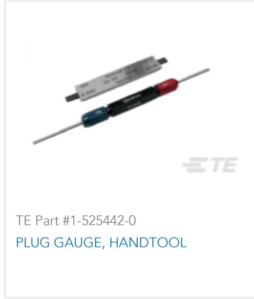
TE Part #1-525442-0 PLUG GAUGE, HANDTOOL