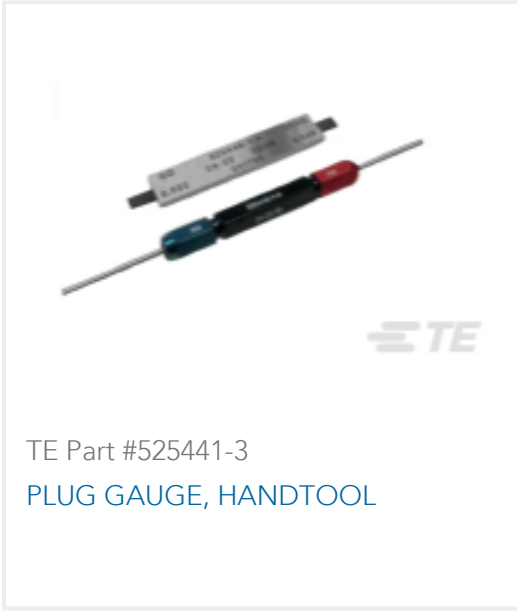
TE Part #525441-3 PLUG GAUGE, HANDTOOL