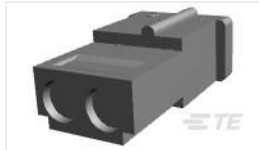
TE Part #1-480318-0 02P CMNL PLUG HSG F/H NATL