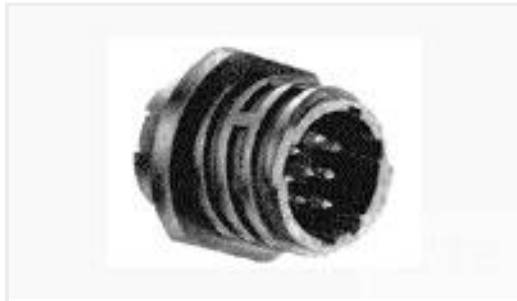
TE Part #206152-1 CPC RECPT ASSEMBLY SIZE 17-28