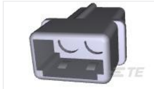
TE Part #1-480319-0 02P CMNL CAP HSG NATL