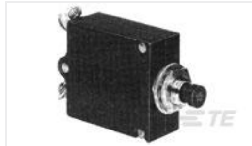
TE Part #7-1393246-6 W23-X1A1G-50=W23/W31