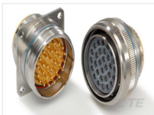
TE Part #ZPF000000000007569 983-0SE 14-07 S6 L