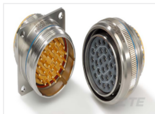
TE Part #ZPF000000000109548 983-0YE 08-98 P6