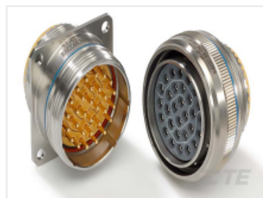
TE Part #ZPF000000000007892 983-15 KE 4-08-03 SN-L