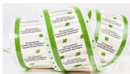
TE Part #991361-000 HT-SCE-5K-1/8-2.0-9