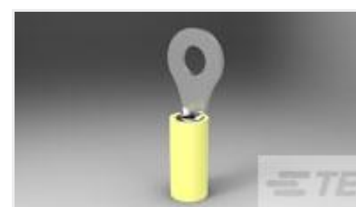
TE Part #53073 TERMINAL,PIDG R 26-24 6