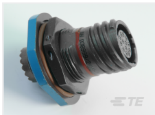
TE Part # CAT-D38999-DTS15G Jam Nut: D38999, 15-35 Insert