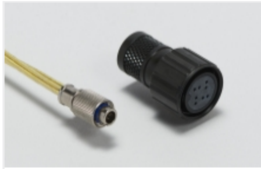
Standard Circular Connectors(497)