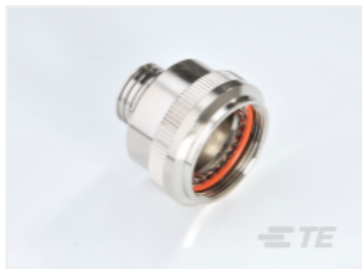
TE Part # 70H1-15-14-1-B 70H1-15-14-1-B