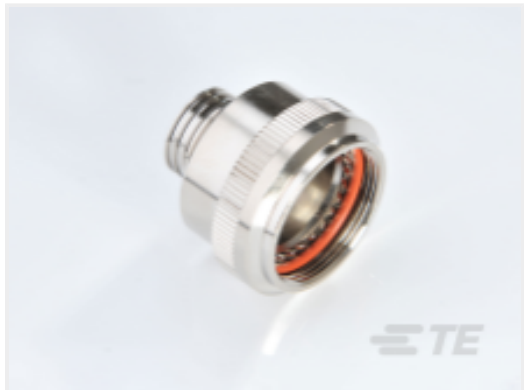
TE Part # 70H1-15-08-1-B 70H1-15-08-1-B