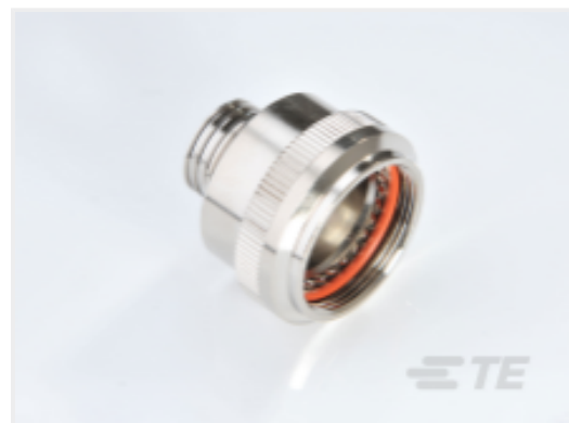
TE Part # 70H1-15-15-1-B 70H1-15-15-1-B