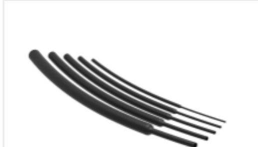
TE Part #CAT-HST-RNF100-BK RNF-100-BK Heat Shrink Tubing