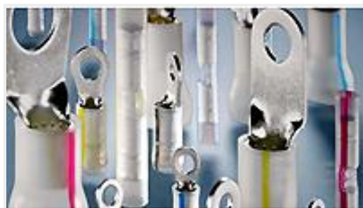
TE Part #53425-1 TERMINAL,PIDG PVF2 R 12-10 10