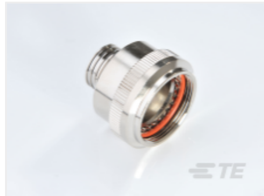
TE Part # 70H1-23-15-1-B 70H1-23-15-1-B