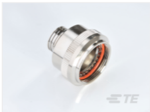
TE Part # EK4780-000 70H1-15-10-1-B