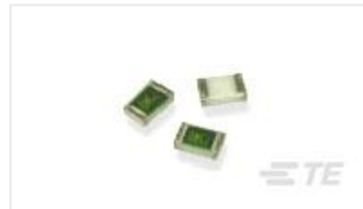
TE Part #9-1879129-2 RN 0402 2K49 0.1% 10PPM 1K RL