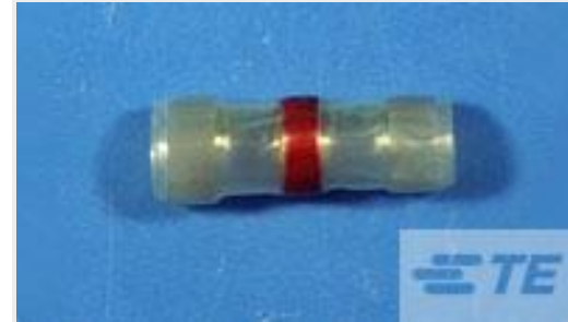
TE Part #448859-000 D-1744-01