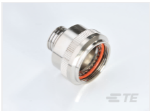
TE Part # 70H1-15-09-1-B 70H1-15-09-1-B