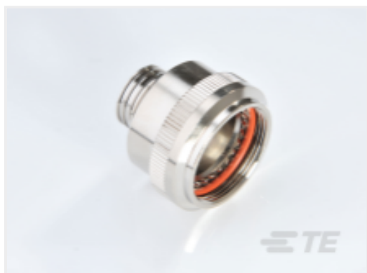
TE Part # 70H1-15-12-1-B 70H1-15-12-1-B