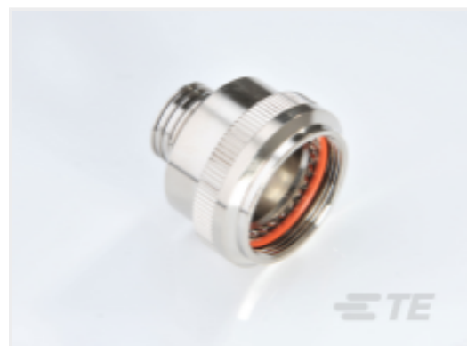
TE Part # 70H1-15-03-1-B 70H1-15-03-1-B