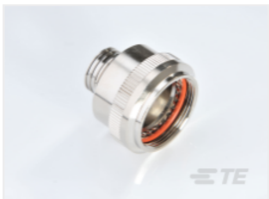
TE Part # 70H1-15-05-1-B 70H1-15-05-1-B