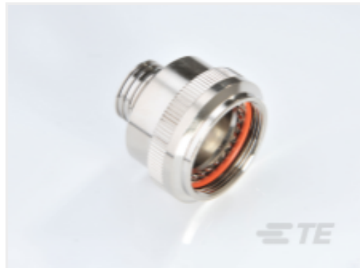
TE Part # 70H1-15-07-1-B 70H1-15-07-1-B