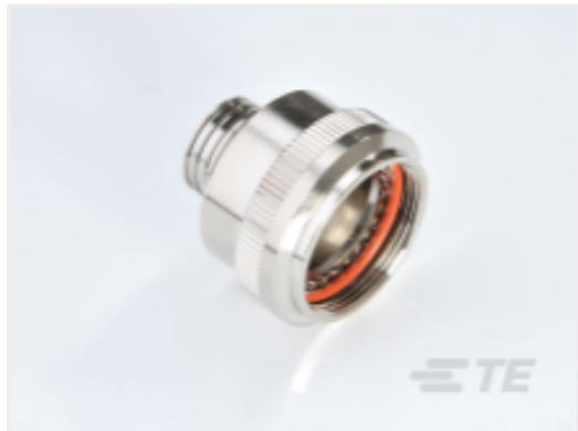
TE Part # 70H1-15-18-1-B 70H1-15-18-1-B