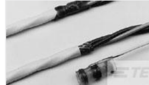
TE Part #621065-000 D-142-65