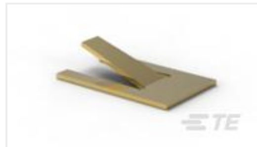
TE Part #1447009-5 SHIELD FINGER 0820 TYPE