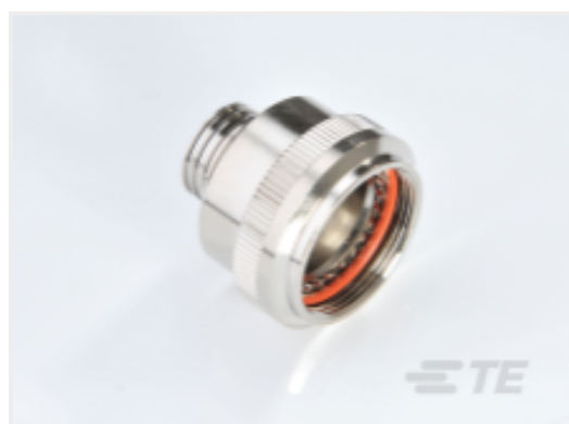
TE Part # 70H1-15-06-1-B 70H1-15-06-1-B

Also in the Series | DEUTSCH 38999 Series III