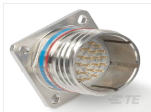
TE Part # CAT-D38999-DTS6O D38999: Square Flange, 15-35 insert