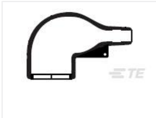
TE Part #878514-000 222K152-25-0