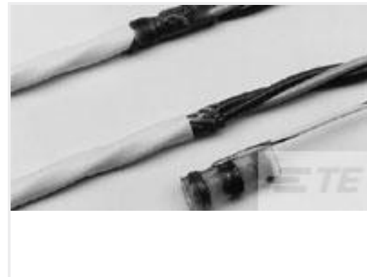
TE Part #621055-000 D-142-51