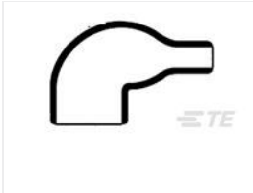
TE Part #814511-000 222A121-3-0