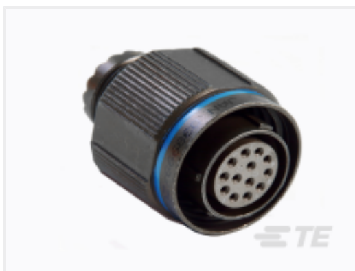
TE Part #YDTS26W19-35PNC001 PLUG ASSY