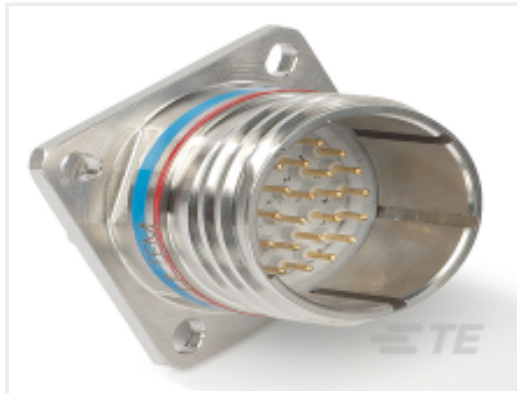
TE Part # CAT-D38999-DTS6Q D38999: Square Flange, 15-18 insert