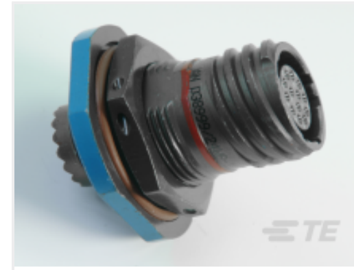
TE Part #YDTS24W19-35SNV001 RECP ASSY