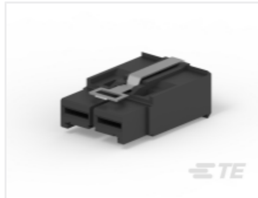
TE Part # 1982299-2 ELCON MINI 2P CABLE CONN, WITH CODING(L)