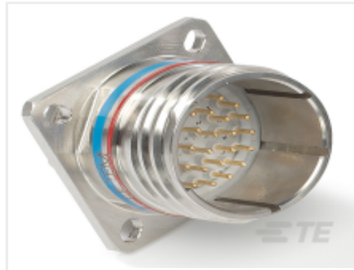
TE Part # CAT-D38999-DTS6E D38999: Square Flange, 11-99 insert