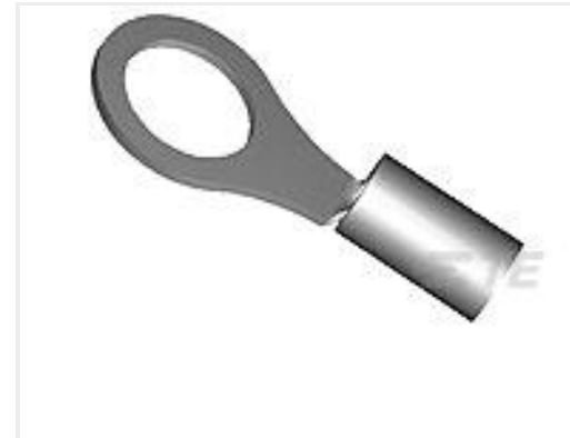
TE Part # 323061 TERMINAL, SOLIS R HR 12-10 8