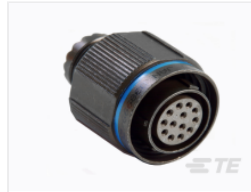
TE Part # YDTS26W23-21PNV001 PLUG ASSY