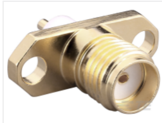
TE Part # CON SMA018-4-G SMA Jack 50 Ohm Panel Mount