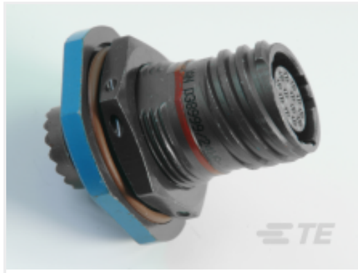
TE Part # CAT-D38999-DTS14X Jam Nut: D38999, 11-99 Insert