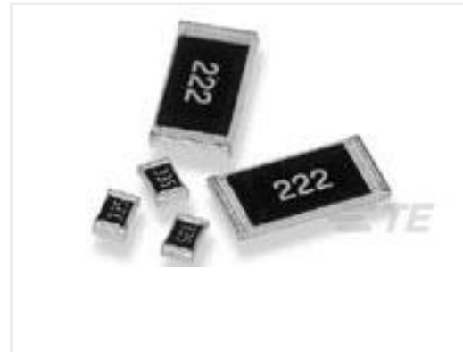
TE Part #1-2176177-5 CRGH0603 1% 2K2 0.2W