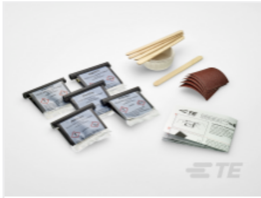
TE Part #583393-000 S1125-KIT-5