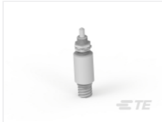
TE Part #K1142223 Limit switch G12-232-D