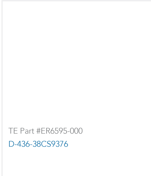
TE Part #ER6595-000 D-436-38CS9376